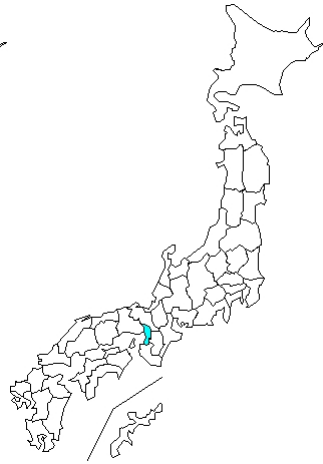
1 case Coxsackievirus A16