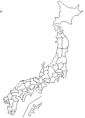
no case Aseptic meningitis