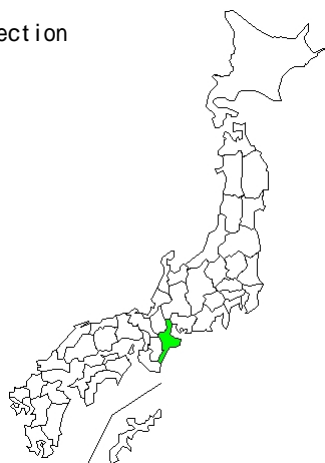
3 cases EV71 Total