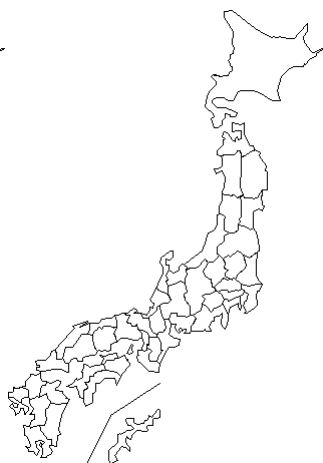
no case Acute Flaccid Paralysis (excluding Acute poliomyelitis)